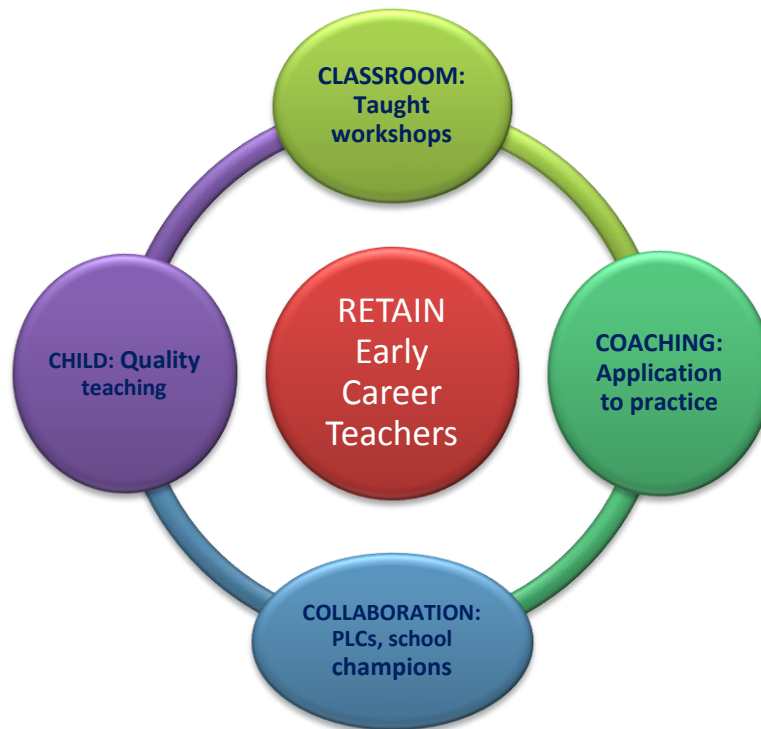
Diagram 1: The 'RETAIN': Early Career Teacher Retention Programme Model

The programme also aimed to improve pupil outcomes in Key Stage One literacy through a focus on developing the literacy pedagogy and practice of teachers involved in the programme.