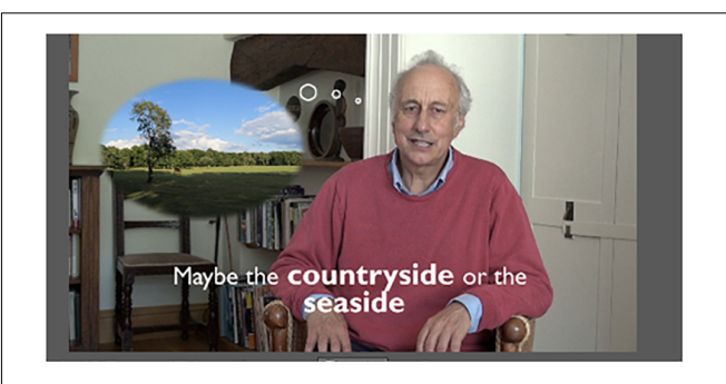
FIGURE 2 | A snapshot of one of the re-filmed scenes on the DVD.

Stroke survivors were recruited through 24 community stroke support groups in West Yorkshire and the West Midlands. CS attended the group meetings to introduce the study or sent the group leader a brief introduction to allow their members to contact her if they were interested in participating. The inclusion criteria required participants to: (1) have received a formal diagnosis of stroke; (2) have been discharged from hospital to live within the local community; (3) be aged 18 or over and;