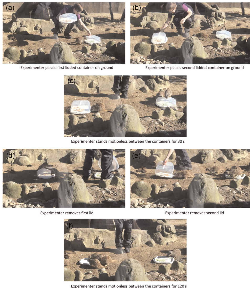
FIGURE 2 Procedure for each food-preference trial (sides counterbalanced) [Color figure can be viewed at wileyonlinelibrary.com ]

We coded videos of each food-preference trial to quantify the meerkats' engagement with each food item. The first sampling point was when both containers were on the ground and the experimenter