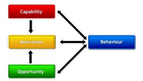
Figure 1: The Capability Opportunity Motivation-Behaviour system – a framework for understanding behaviour<sup>25</sup>.

improved health outcomes. Utilising midwives to deliver other health-related messages in this way could be an impactful method for other public health interventions in Uganda and beyond.