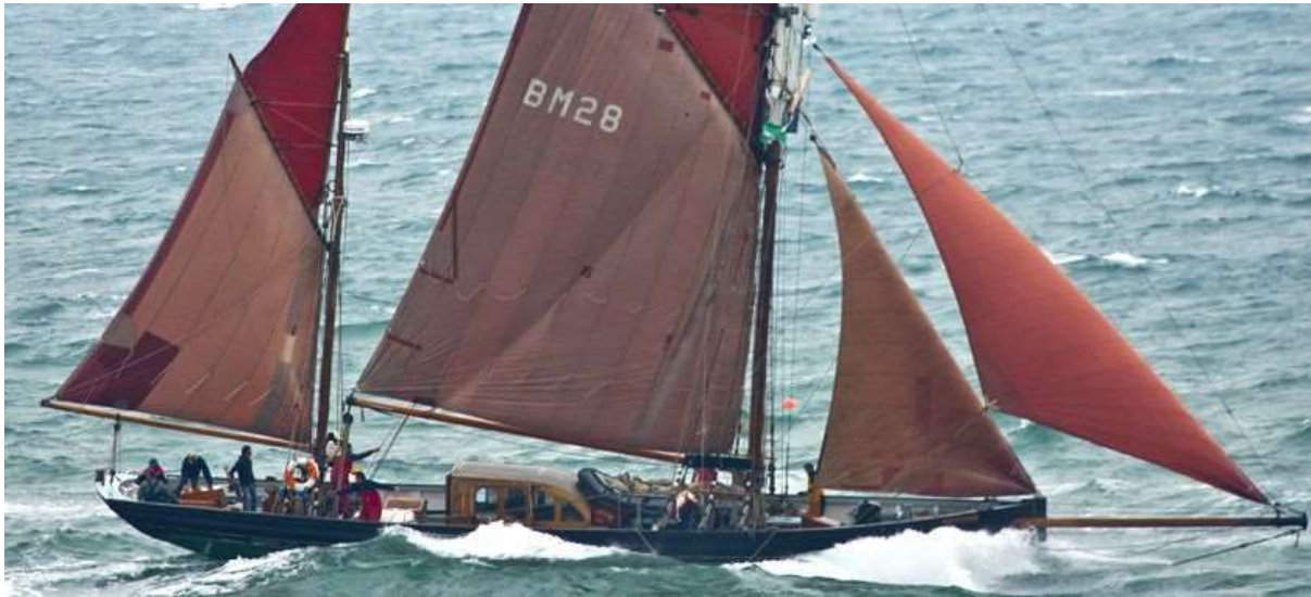
Plate 1: The Brixham Trawler Provident

More than activities: using a ‘sense of place’ to enrich student learning in adventure sport.