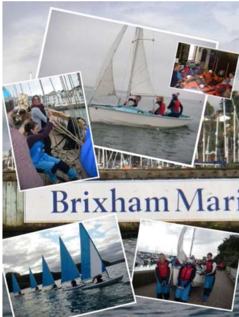
Plate 7: Student Montage