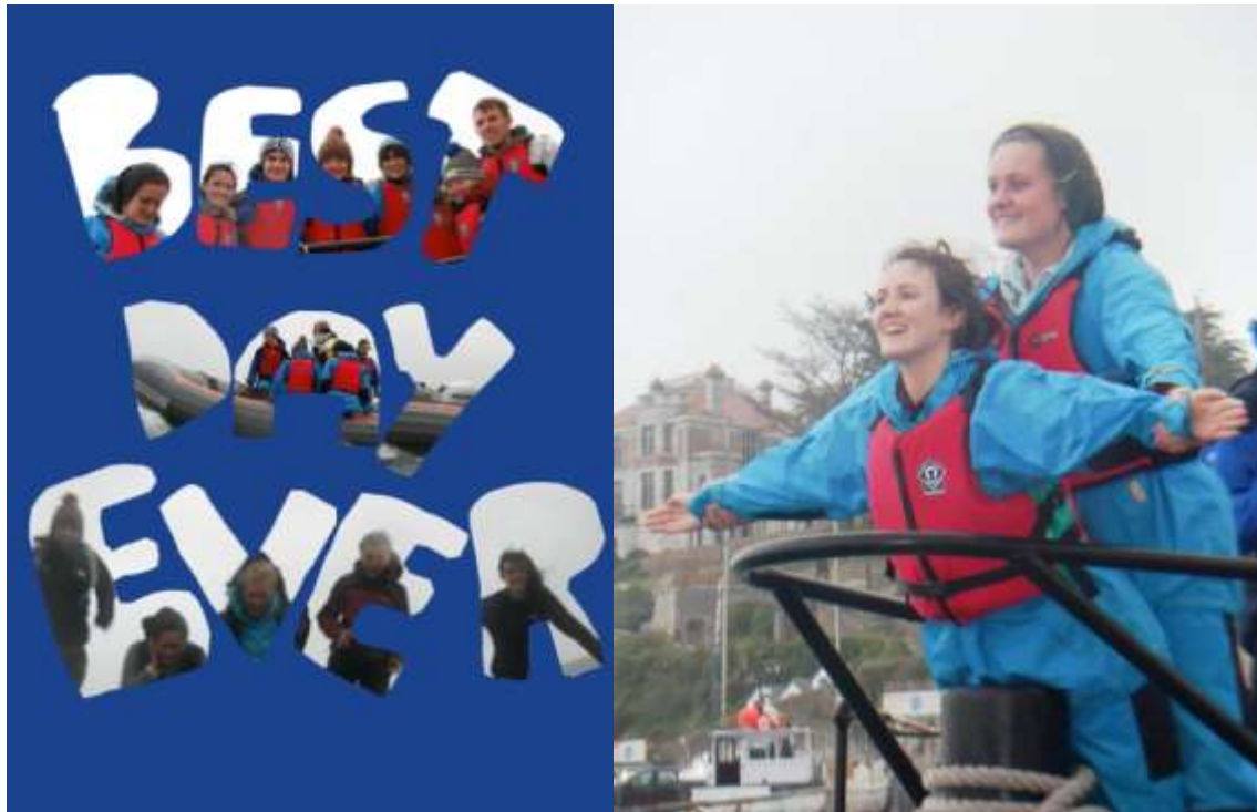
Plate 5: 'The Best Day Ever' – Student Photograph