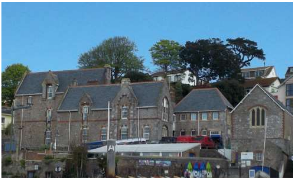
Plate 2: British Seamen's Boys' Home