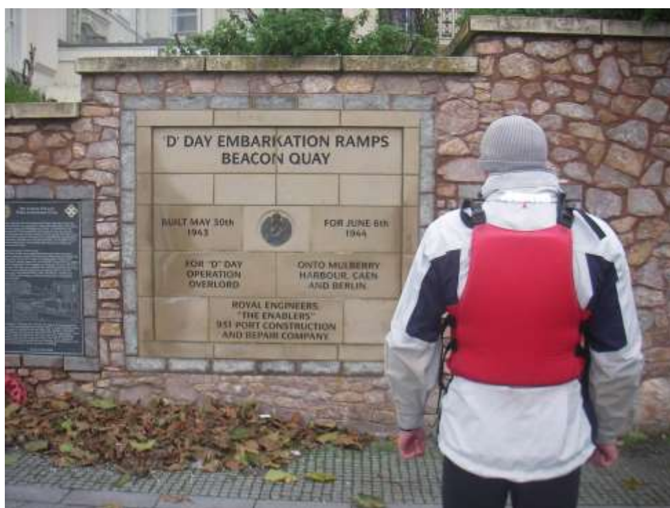
Plate 4: Thoughtful contemplation