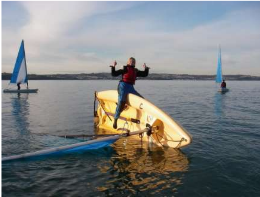
Plate 8: Successful dry capsize